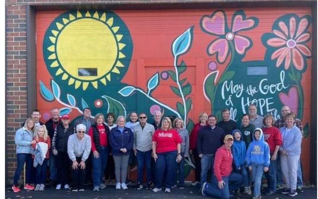
Rotary volunteers strengthen our community in many ways. One Saturday per quarter we sort and box food at the WARM warehouse at 150 Heatherdown Drive from 10 am to noon. Our remaining dates for 2025 are: